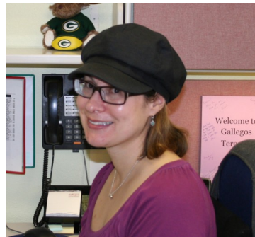
FYI: Wolott Office