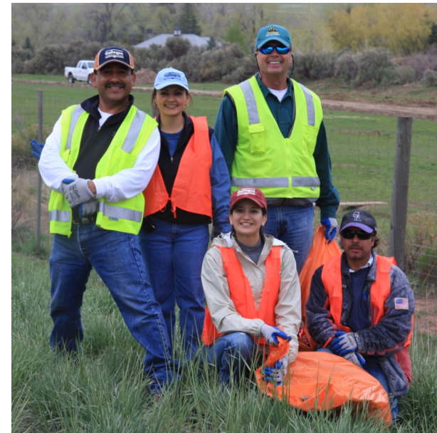
2010 Gallegos Clean Up Crew Members take time for a quick picture.

Here is the link for more information: http://www.eagleriverwatershedcouncil.org/Events/