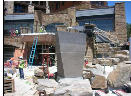
The monolith set in place.