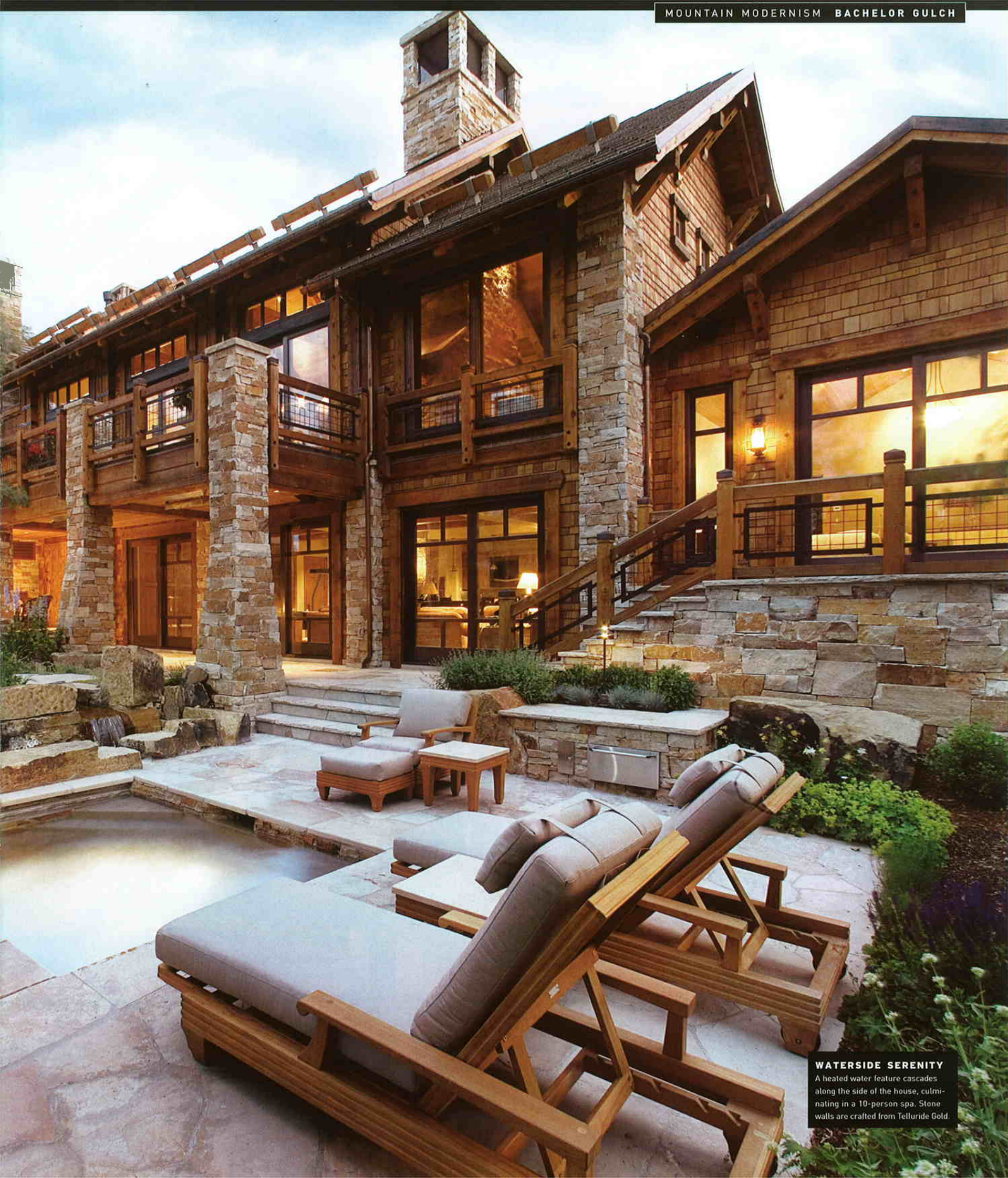
WATERSIDE SERENITY A heated water feature cascades along the side of the house, culminating in a 10-person spa. Stone walls are crafted from Telluride Gold.