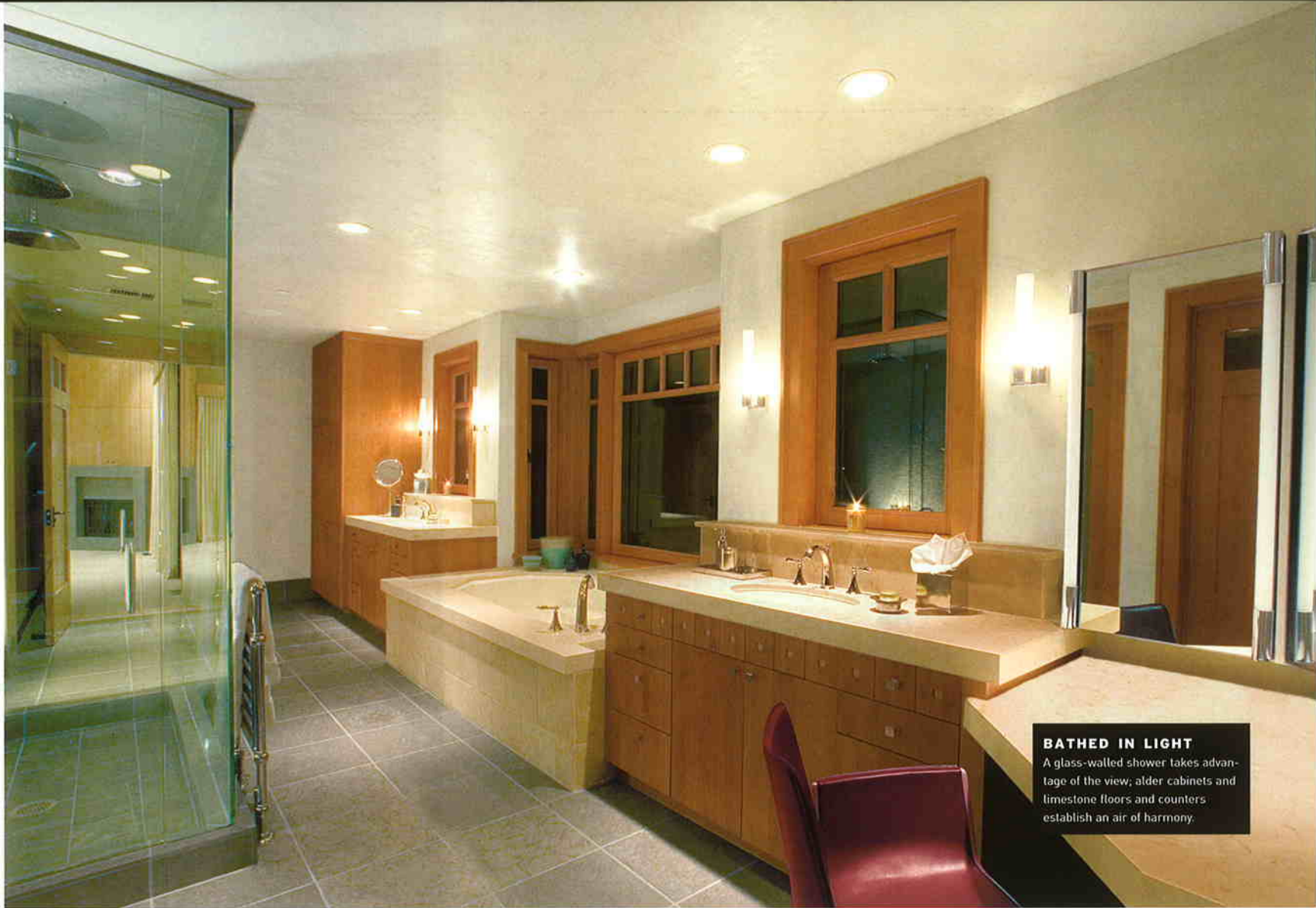
BATHED IN LIGHT A glass-walled shower takes advantage of the view; alder cabinets and limestone floors and counters establish an air of harmony.