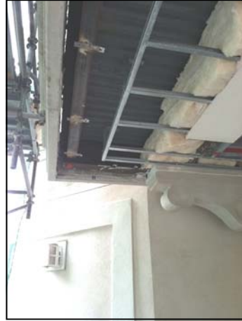
Cast Stone Demo