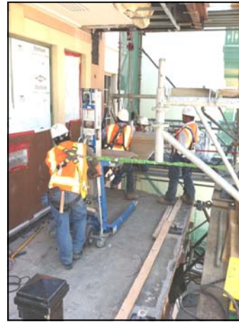
Cast Stone Corbel Installation