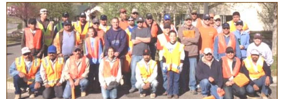
The Eagle Cleanup Crew